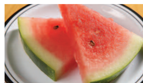
Fresh Water Melon Wedge