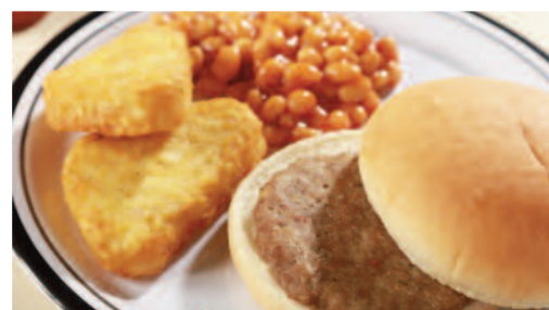
Sausage Pattie in a Bun, Hash Browns and Baked Beans