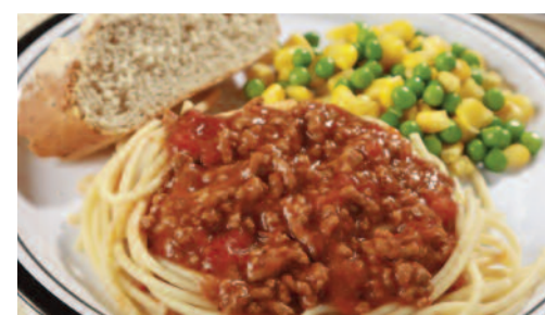
Spaghetti Bolognese served with Garlic & Herb Bread and Seasonal Vegetables