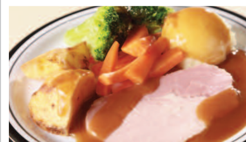
Honey Roast Gammon served with Roast/Mashed Potatoes, Seasonal Vegetables & Gravy