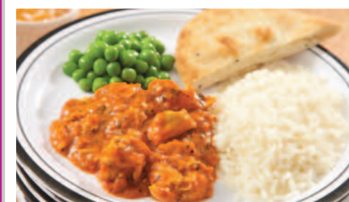
Chicken Tikka Masala served with Rice, Naan Bread & Seasonal Vegetables