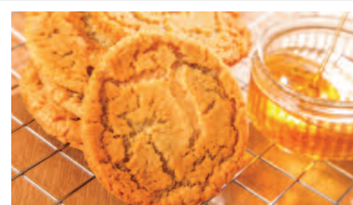
Golden Crunch Cookie