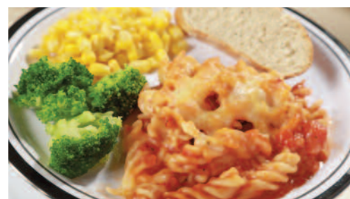
Cheese & Tomato Pasta served with Garlic & Herb Bread and Seasonal Vegetables