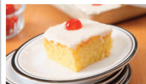
Iced Sponge Cake