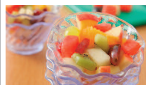
Fresh Fruit Salad