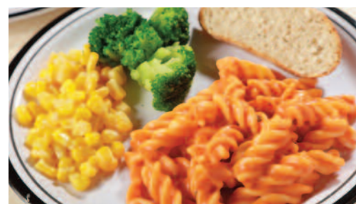
Tomato & Mascarpone Cheese Pasta served with Garlic & Herb Bread and Seasonal Vegetables