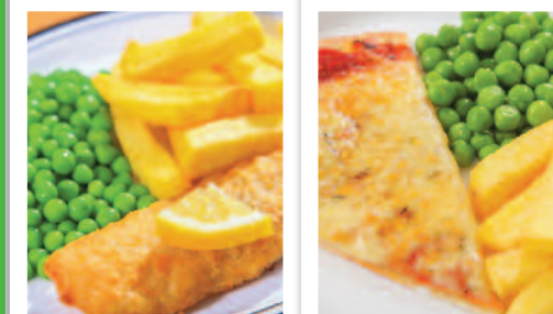
Battered Fish (MSC) or Cheese & Tomato Pizza served with Chips & Peas or Baked Beans

VEGETARIAN VERSIONS OF THE ABOVE MEAL AVAILABLE DAILY