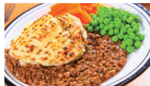
Minced Beef in Gravy served with Roast/Mashed Potatoes, Seasonal Vegetables & Gravy