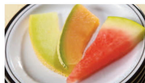
Trio of Melon