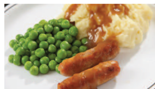
Sausages served with Mashed Potato, Seasonal Vegetables & Gravy